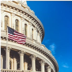
The $2 trillion emergency relief package represents a bipartisan effort intended to assist individuals and businesses during the ongoing coronavirus pandemic and accompanying economic crisis.